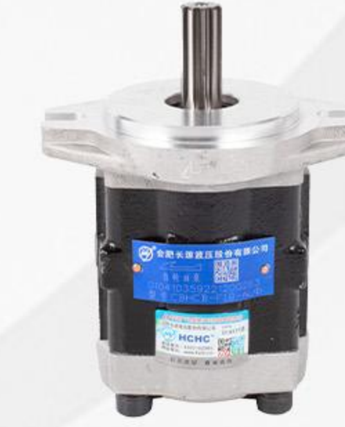
Hydraulic Pump High efficiency and durability