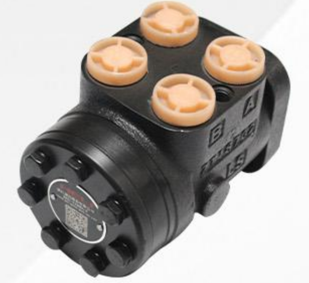
Orbitrol Flexible and responsive operation