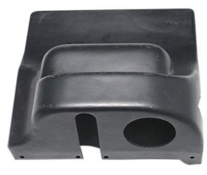
Housings Protects internal parts, aesthetically pleasing