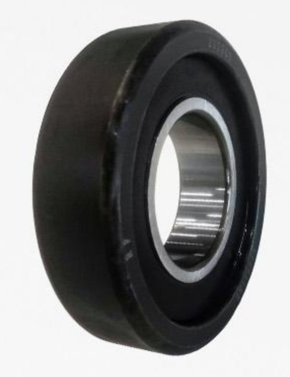
Main rollers Stable operation and durability