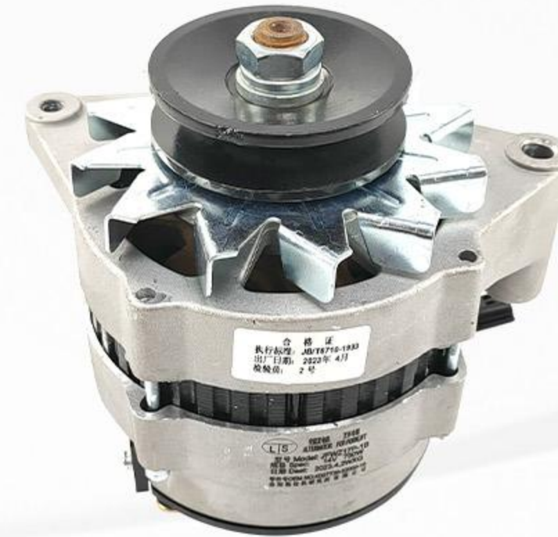
Alternator Stable output, high efficiency, long life