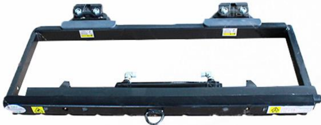
TJS Side Shifter

Wide range of compatibility, multiple sizes available