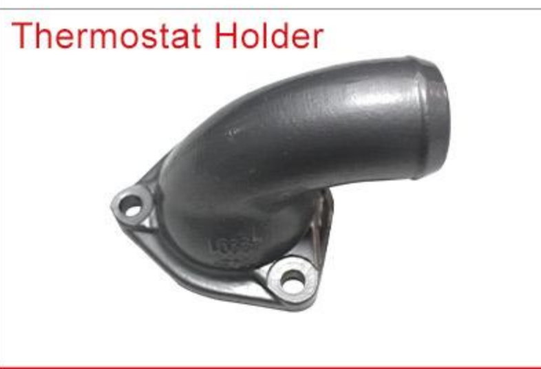
Cooling System Highly efficient heat dissipation, engine protection, long service life