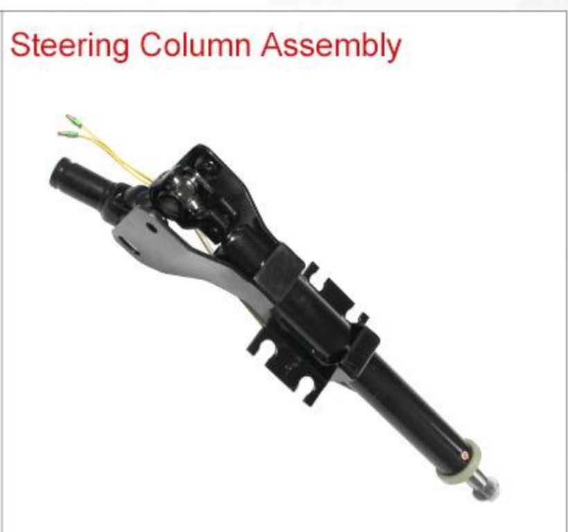
Steering Column Assembly