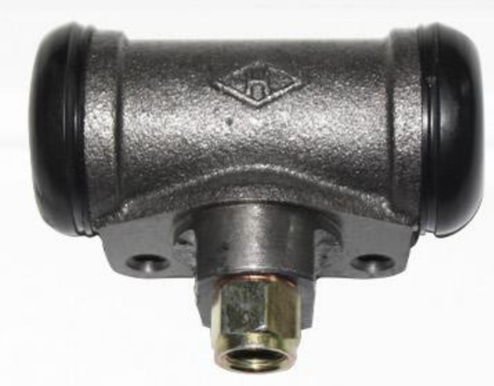
Brake Cylinder Efficient braking, quick response