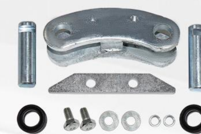
Steering Cylinder Link Structural stability and durability