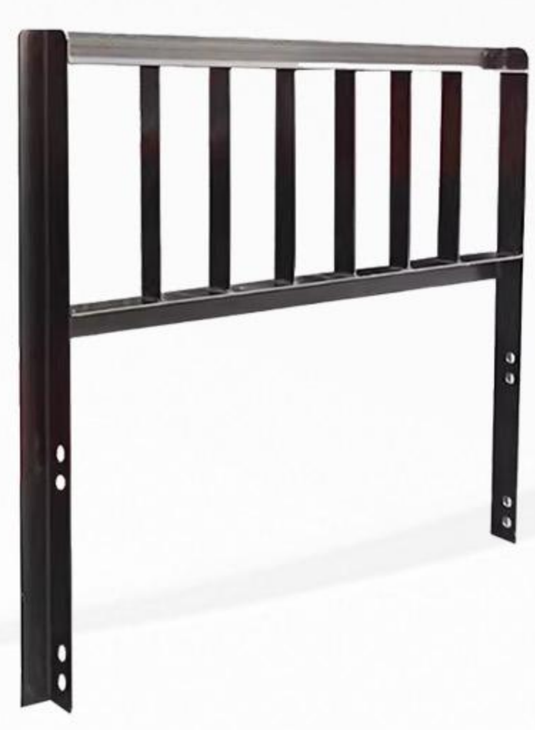
Forklift shelving Safe and reliable, easy to operate