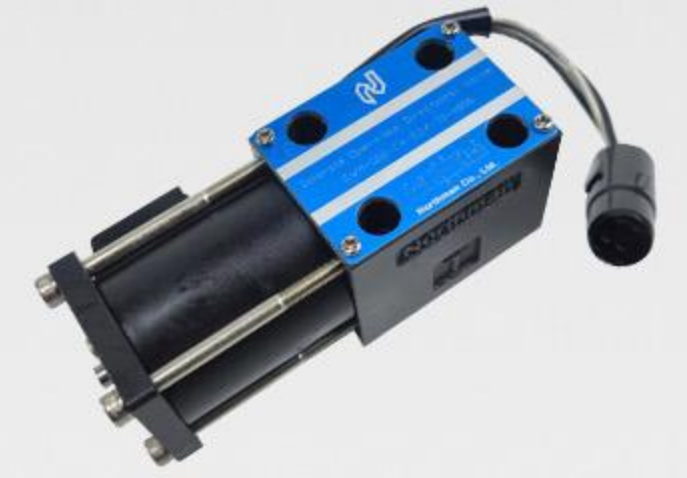
Solenoid Valve Precise control, fast response, high reliability