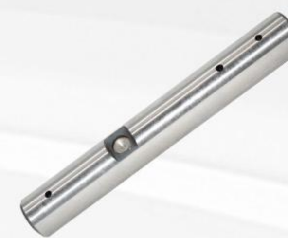
Knuckle Pin Stabilizes steering and improves handling