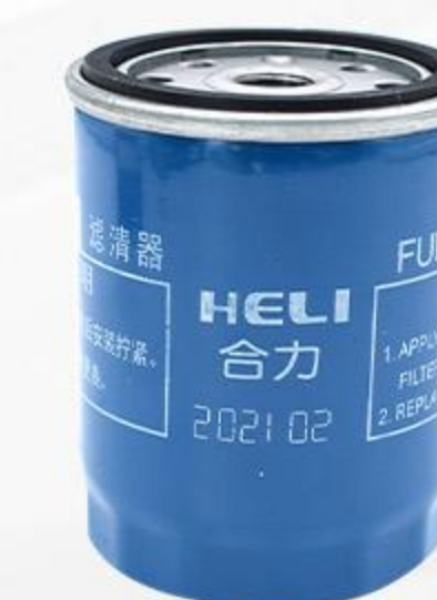
Fuel Filter/Fuel Filter Holder Optimizes fuel quality and extends engine life