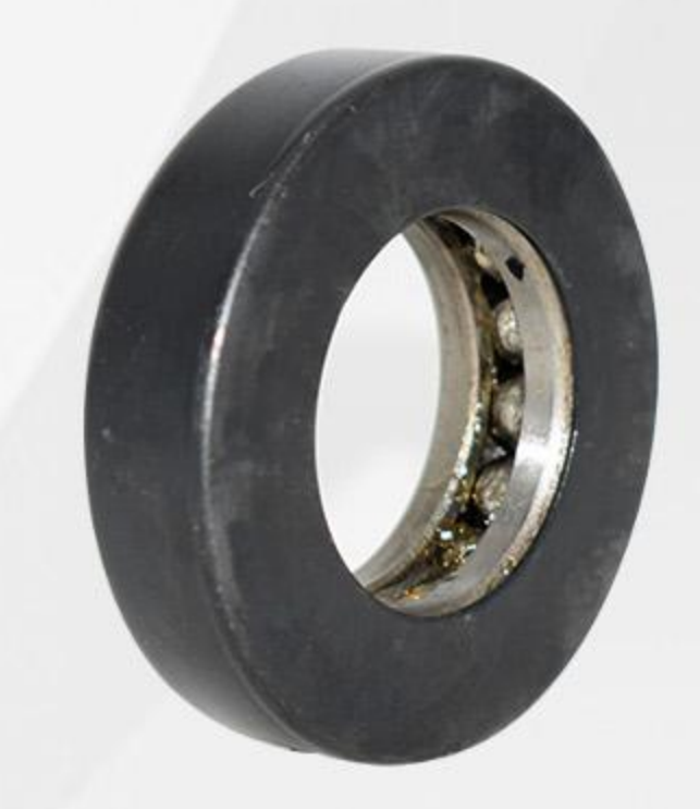
Plane Bearing/Pressure Bearing Stable support and durability