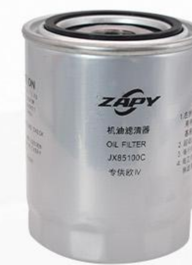
Oil Filter/Oil Filter Holder Highly efficient filtration and engine protection