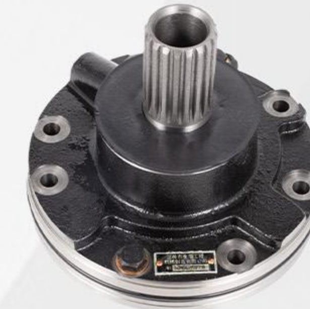
Transmission Charging Pump Assembly And Accessories Stabilized fuel supply, improved fuel economy, reduced failure rate