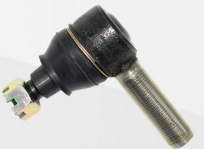
Ball Joint Smooth transmission for durability