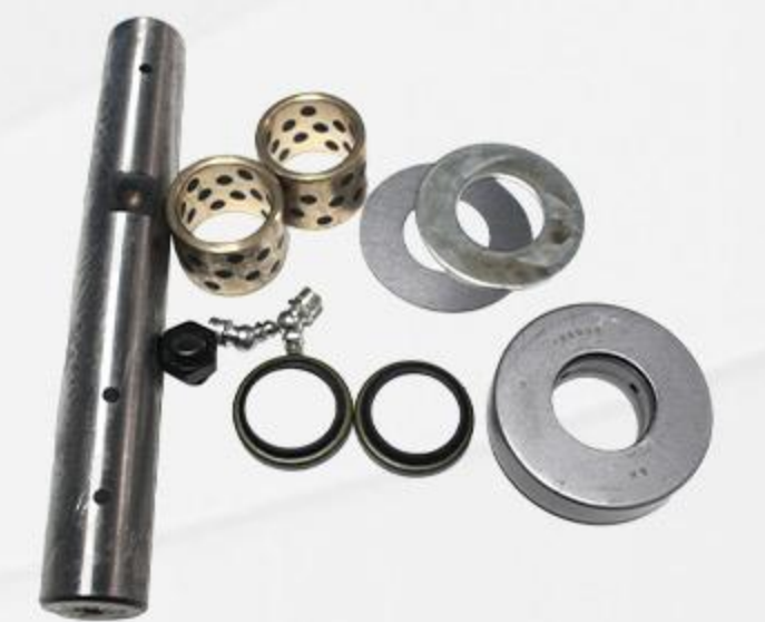
Knuckle Repair Kit Restores performance and extends service life