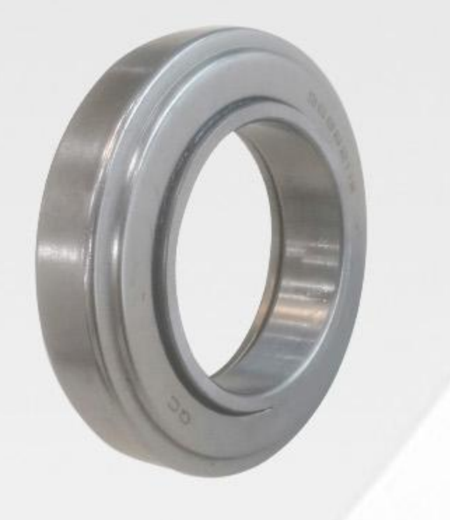
Separate Bearing/Separate Bearing Housing Efficient drive, high durability