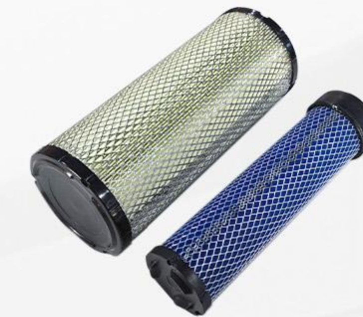
Air Filter/Air Filter Housing Improves air quality and protects the engine