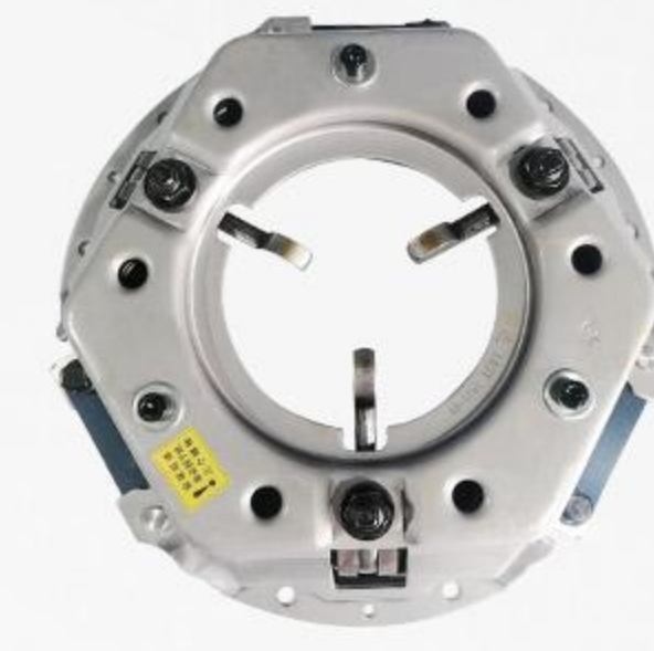
Clutch Cover High load carrying capacity, strong stability, wear-resistant