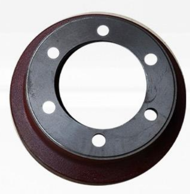
Brake Drum Efficient braking and durability