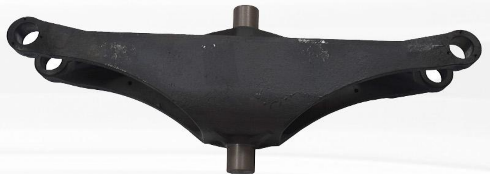
Rear axle body