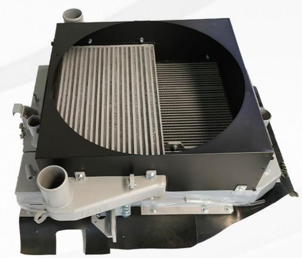
HELI Original Radiator Efficient heat dissipation, quality assurance