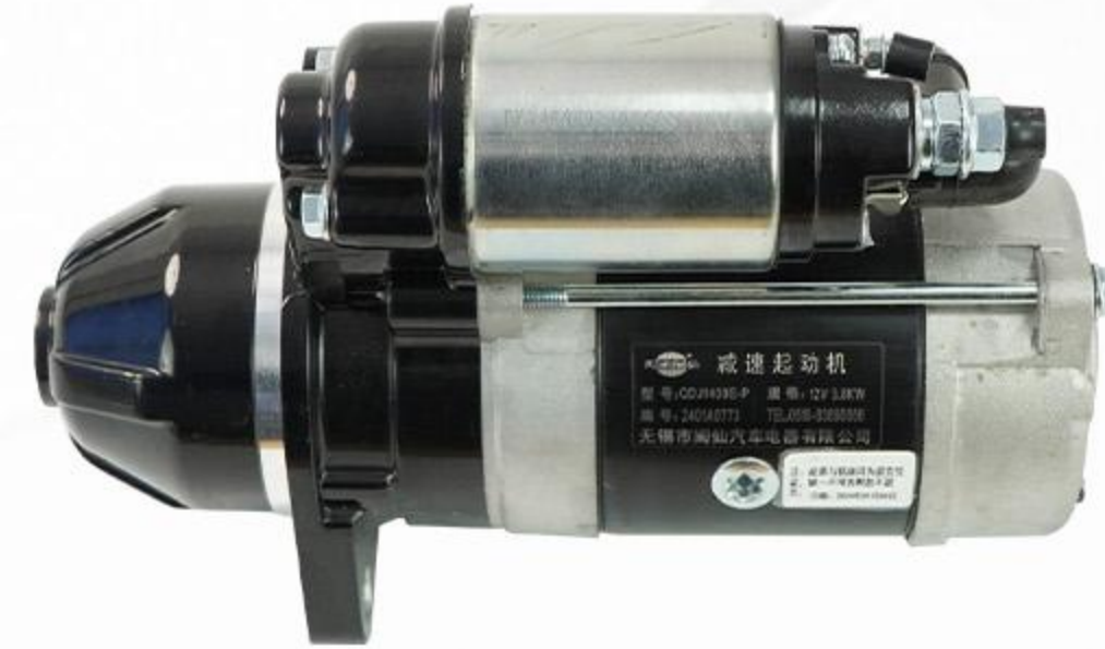
Starter High performance, low fuel consumption, environmental protection and energy saving