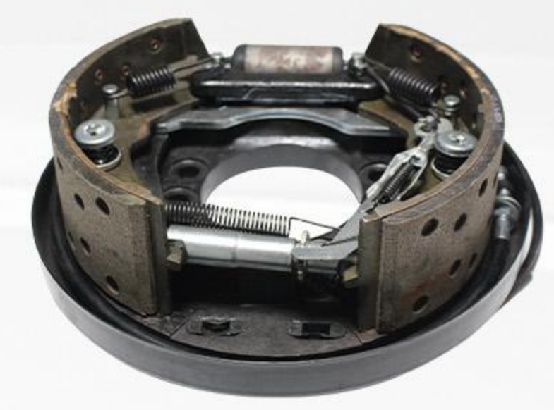
Brake Assembly Efficient braking, high stability