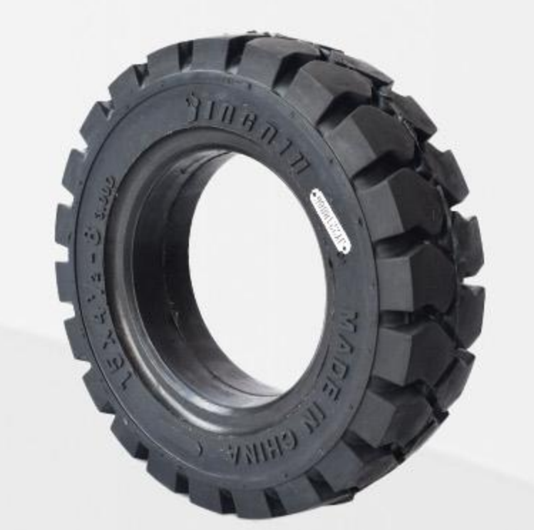
TOUGHCHLI Solid Tire Wear and tear resistant, good stability