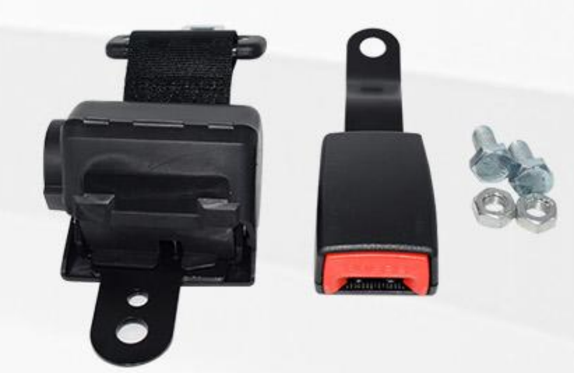
Seat Accessories Enhanced comfort and ease of operation