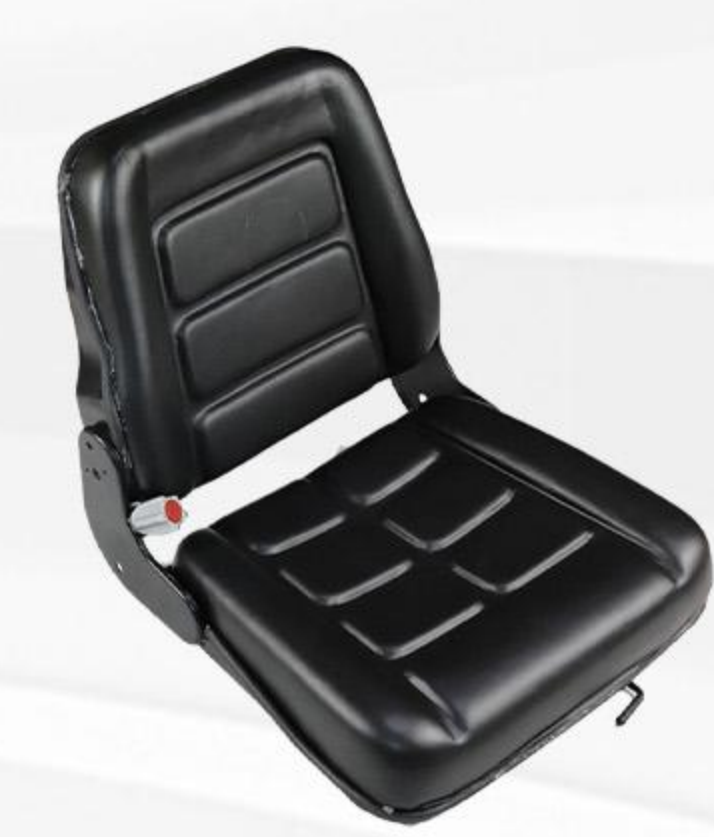
Blister Seat Comfortable seating and durability