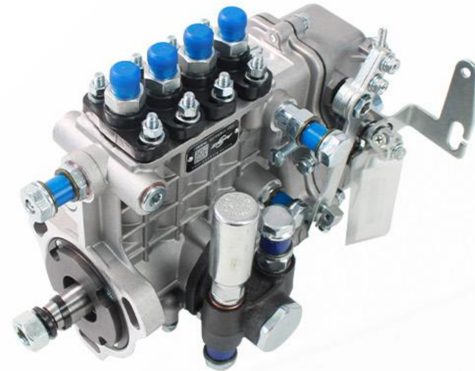
Injection Pump High performance and durability