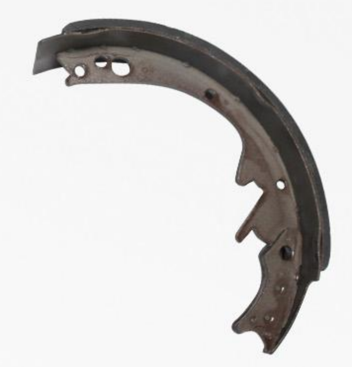
Brake Shoes Efficient braking and durability