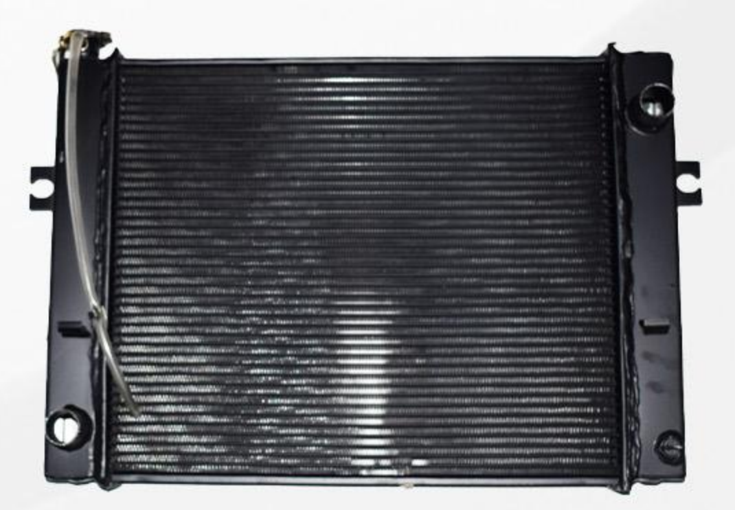
Other Radiators Wide compatibility, multiple specifications available