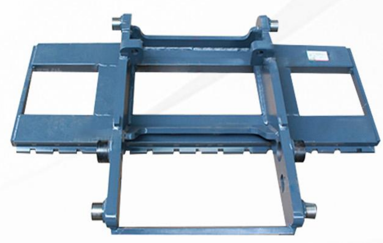
Fork Assembly Strong load-bearing capacity and durability