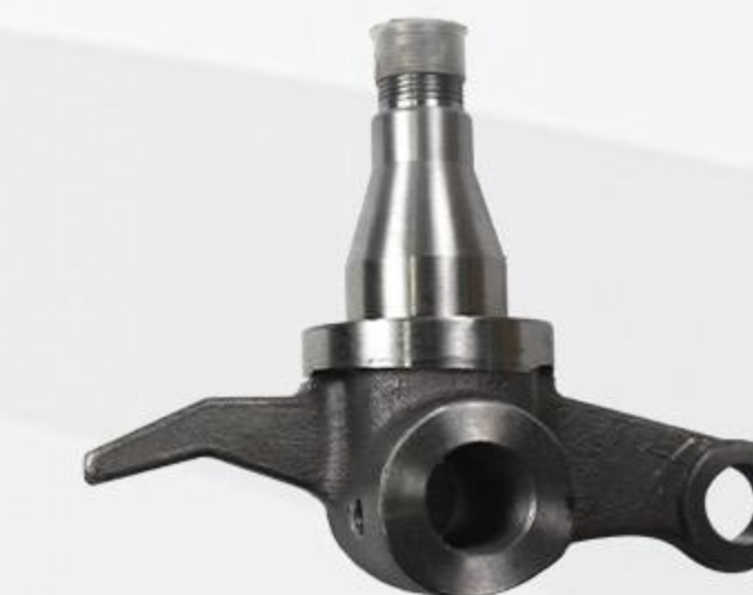
Knuckle Precision steering for durability