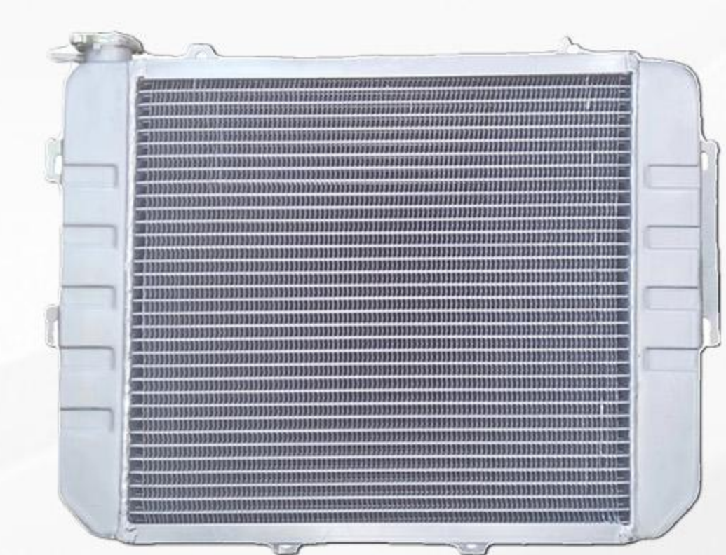
HangCha Original Radiator Highly efficient heat dissipation, engine protection