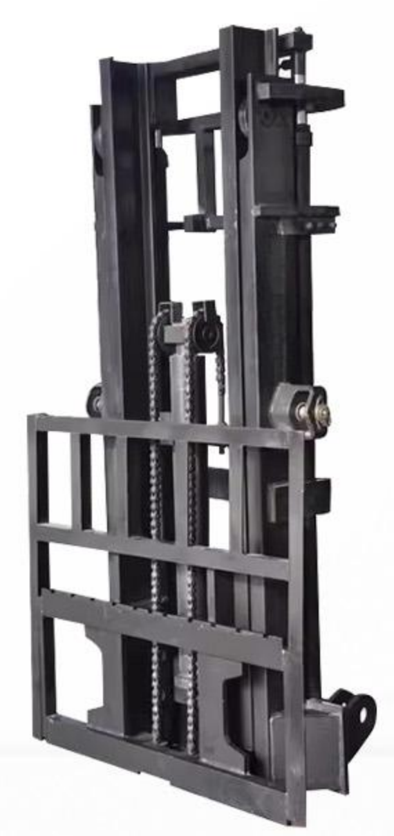
Forklift Frame Assembly Structurally sound, high load-bearing capacity