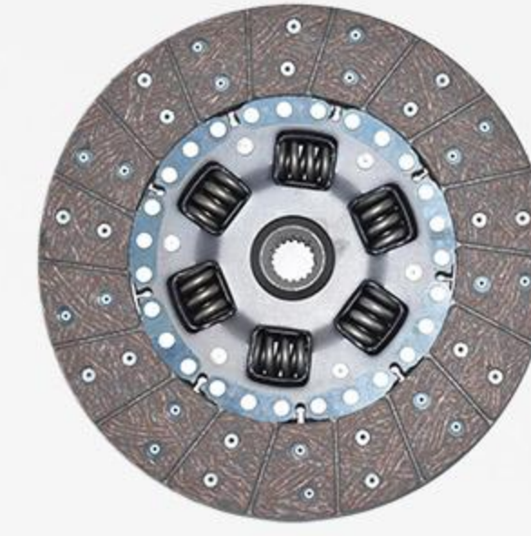
Clutch Disc Efficient power transmission, smooth gear shifting, high durability