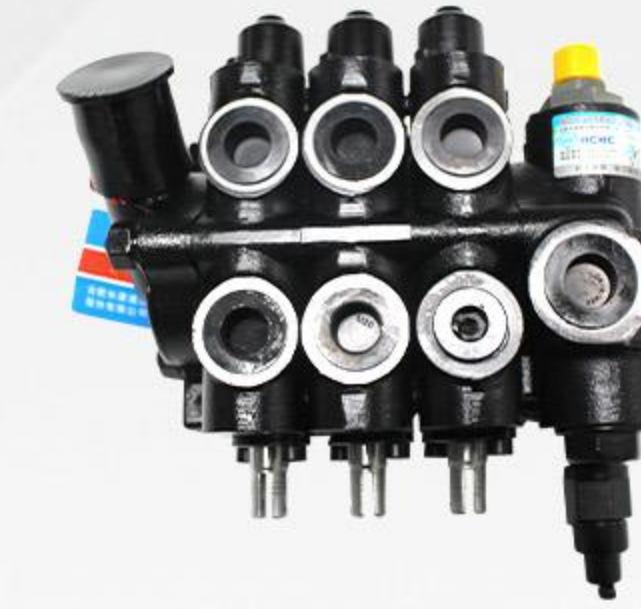
Control Valve Precise control and stability