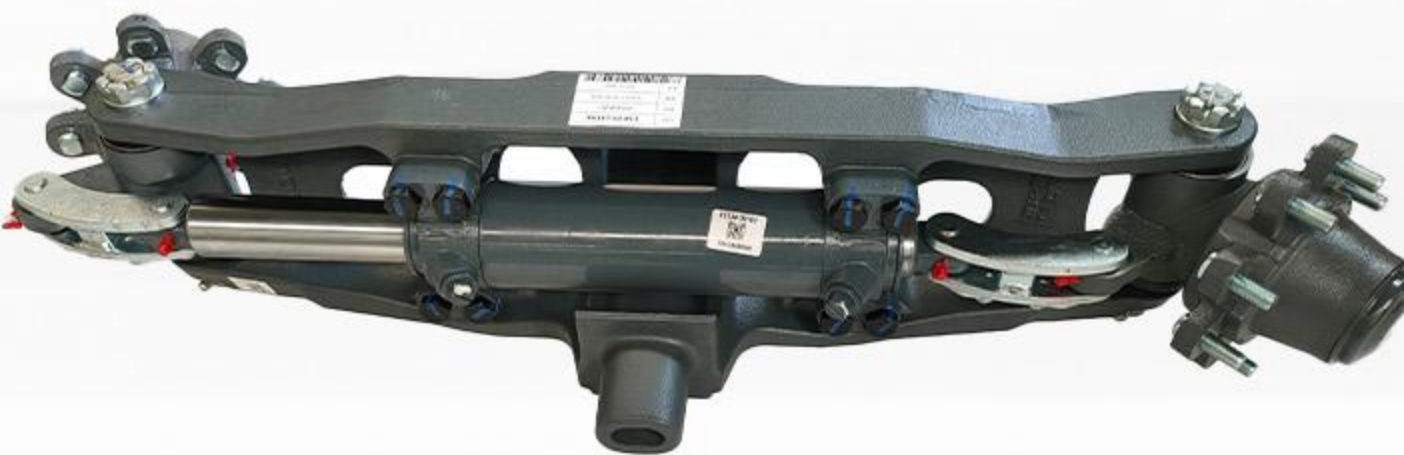
Rear Axle Assembly