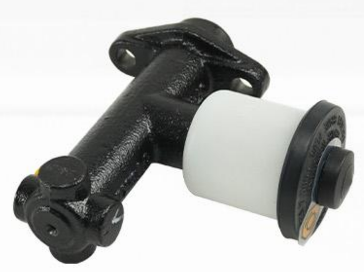
Brake Master Cylinder Efficient braking, high stability