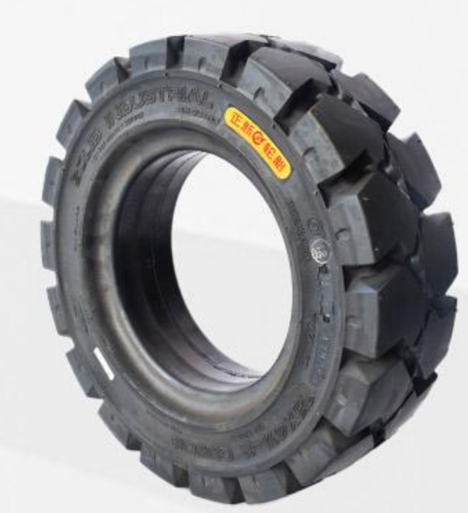
ZhengXin Solid Tire Durable and stable