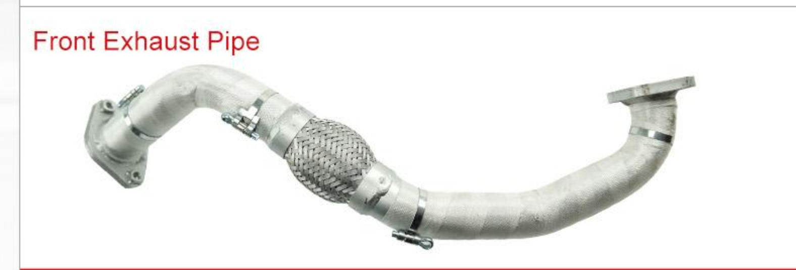
Exhaust System Optimize emission, environmental protection and energy saving, improve power performance