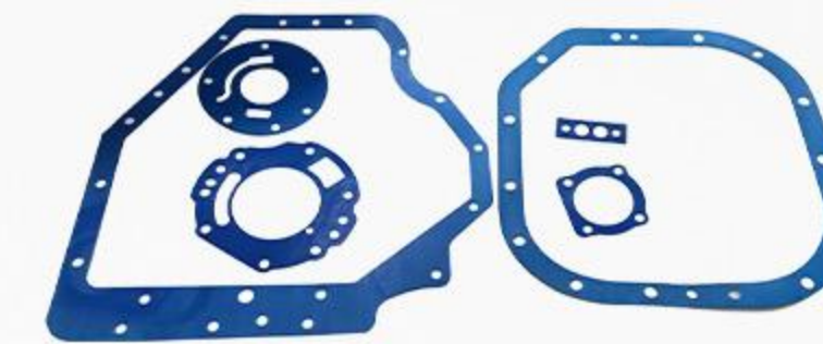
Transmission Repair Parts High-quality materials, restoring performance and extending service life