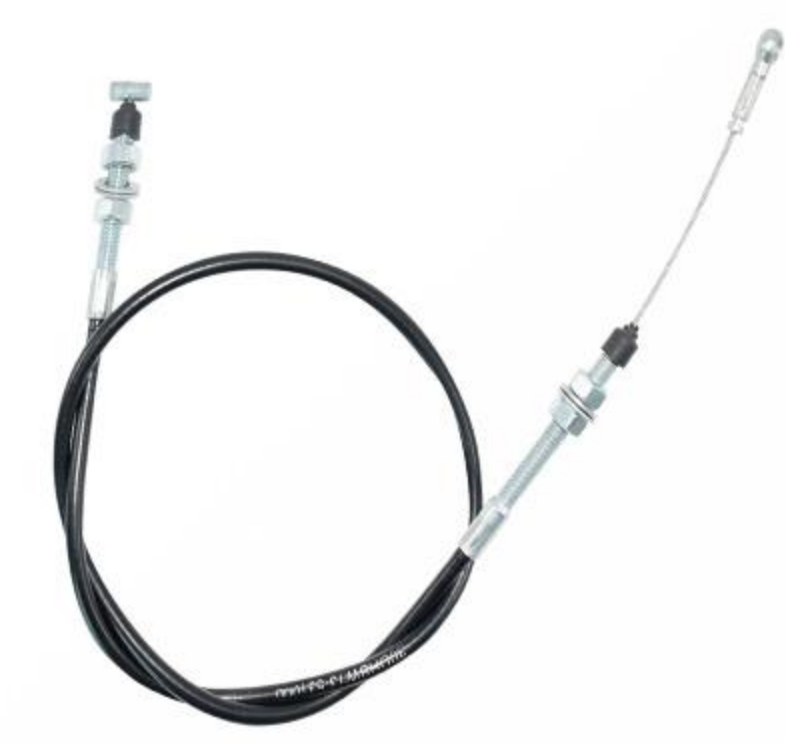
Cables Precise control and durability